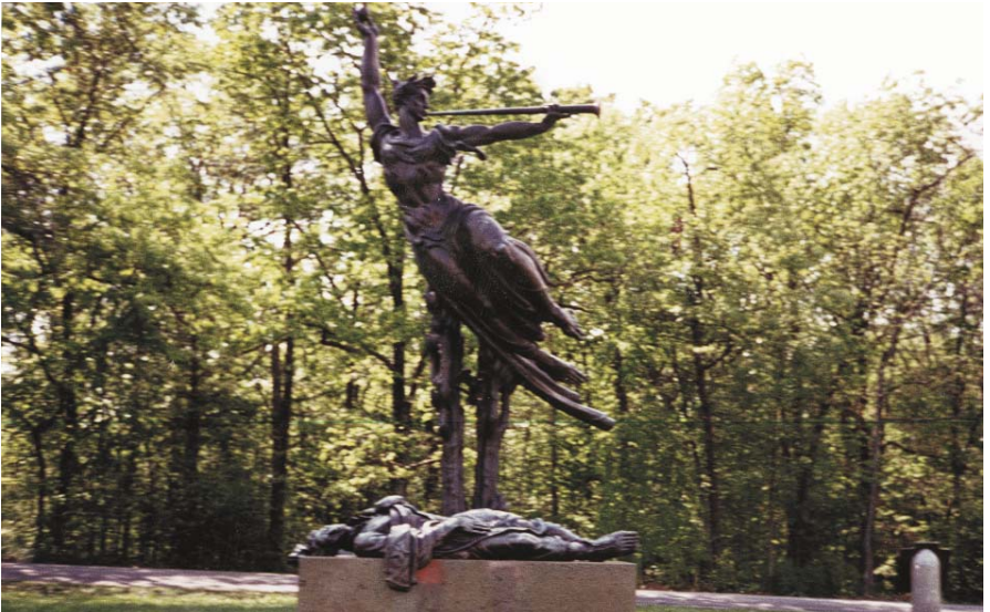
LOUISIANA MEMORIAL (GOD'S ANGELS WERE THERE) GETTYSBURG BATTLE PARK