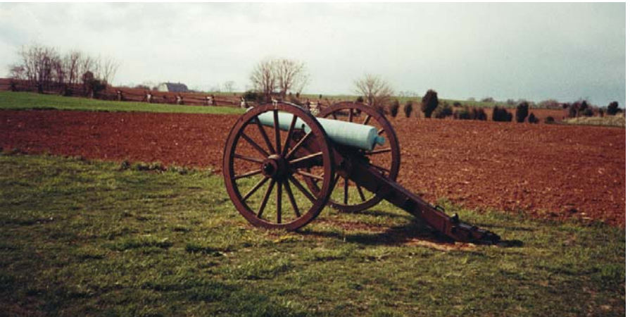
MILLER'S CORNFIELD ANTIETAM BATTLE PARK