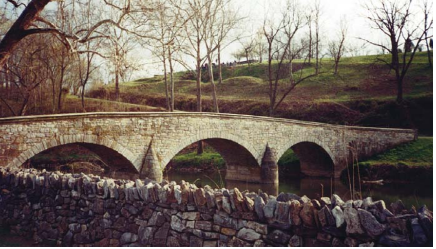
BURNSIDE'S BRIDGE ANTIETAM BATTLE PARK