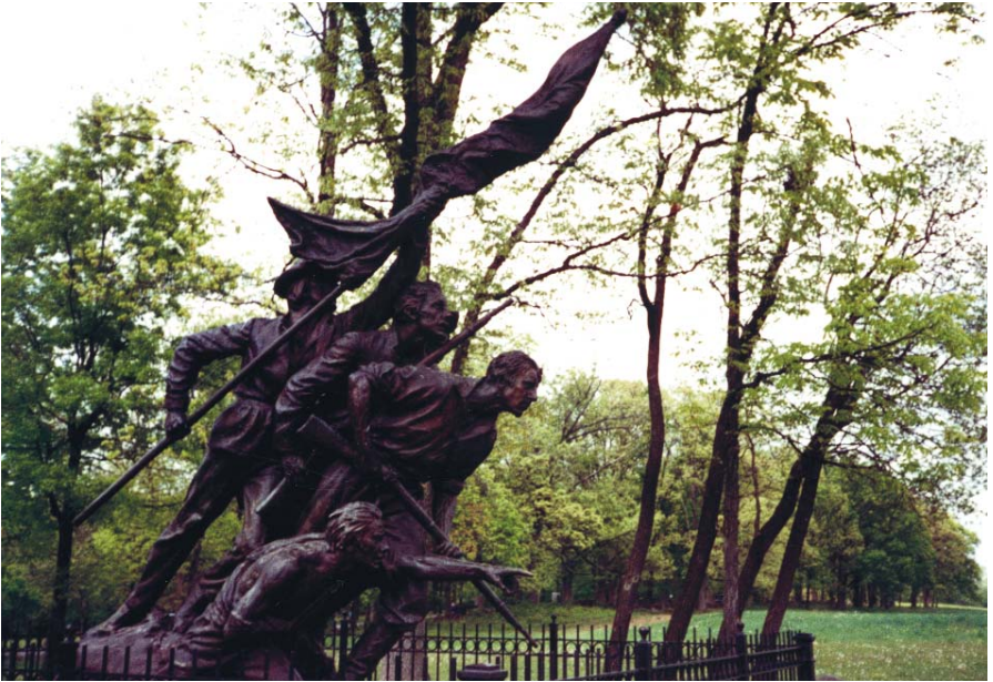
NORTH CAROLINA MEMORIAL (WE SENT THEM OUR LOVE)